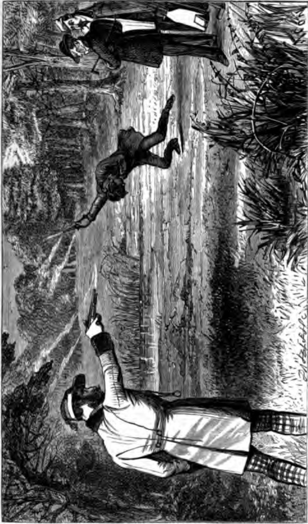
A duel to the death.—p. 121